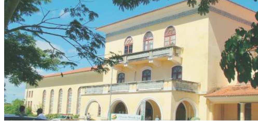
College of Agriculture and Life Sciences Eliseu Maciel

Private institutions that already existed in Pelotas also came to be part of UFPel, as it is the case of the Conservatory of Music, School of Fine Arts, the Medical School and the Agrotechnical School. The agrarian sector, of great importance for the development of the region (predominantly of rural and agronomic economy), was highly benefited by the Schools of Agriculture Engineering and Meteorology.