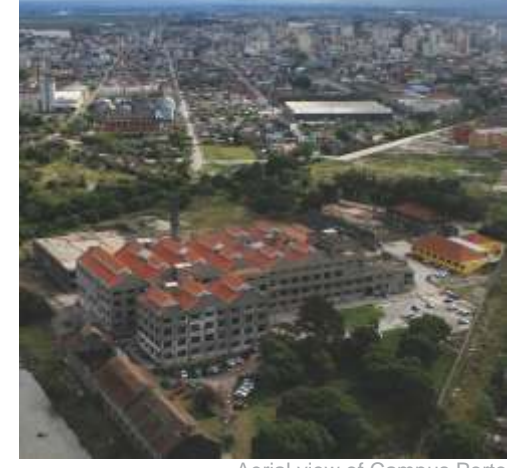
Aerial view of Campus Porto

Ever since it joined, in 2007, the Program for Restructuring and Expansion of Federal Universities (REUNI) developed by the Ministry of Education, UFPel has seen substantial advances expressed in the growth of its academic performance, through an increasing number of seats offered and the creation of new undergraduate and graduate courses, along with the expansion of its patrimony.