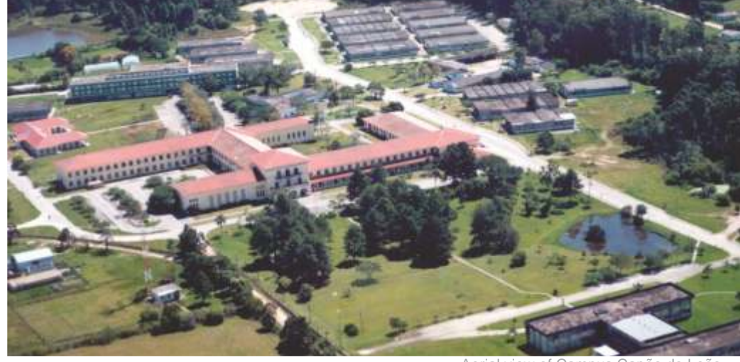
Aerial view of Campus Capão do Lea

Always in search of new ways to provide hundreds of youth and adults with the opportunity of public education and to contribute for the overall improvement of the economical, social and cultural needs of the region, the Federal University of Pelotas has been increasingly investing in teaching, research and extension.