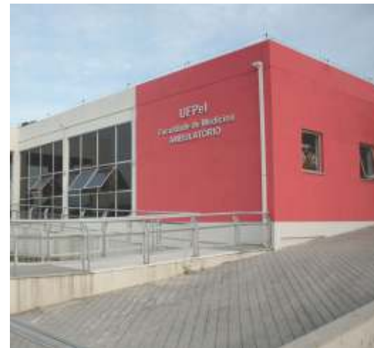
Clinic of the Medical School

It is worth emphasizing the important role played by the Schools of Medicine and Nursing in the developmental process of the University, as both gave rise to the whole structure of health care at UFPel. Through the clinics of the Medical School and the Teaching Hospital of the University, such structures have decisively contributed, up to the present day, for the health of those who live in Pelotas and neighboring cities, due to the large number of health care services provided to public patients.